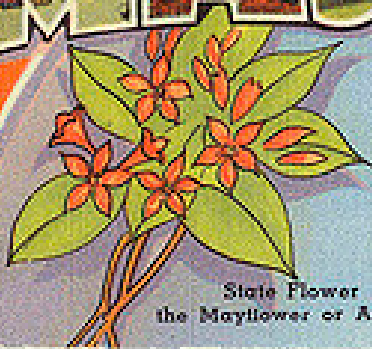
State Flower the Mayflower or Arbutus